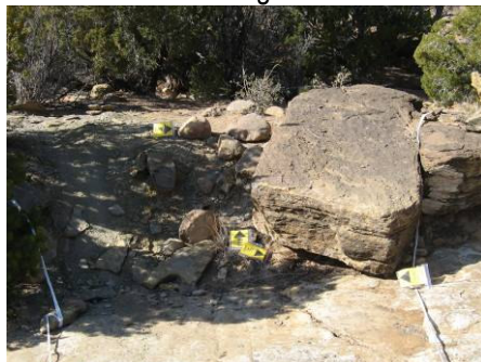
Section Five, Lower Class

Section Four was a rubble and dirt hill climb with Amateurs up the middle, and Intermediates turning right immediately, then left and up the climb past a tree. Five was at the bottom of Lower Pool, a short-but-sweet section, offering an angled slab for Intermediates to climb, and round rocks rolling in the sand.