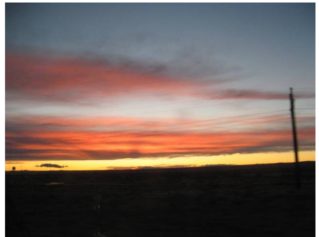
Sunset, I-25 near Bernalillo, Feb 8, 2009