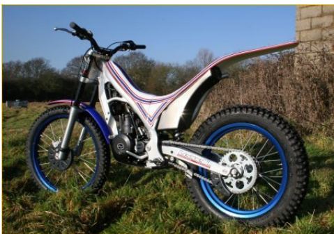
Greeves 280 Trials